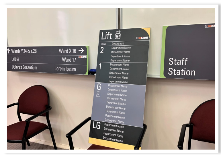
Example hospital signage presented to the team.

visible across the face of the building as the scaffolding continues to come down.