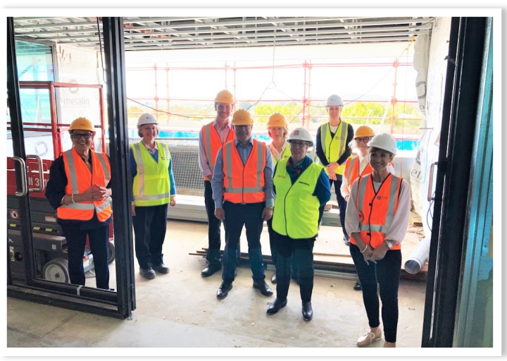
The SNSWLHD Board and CE tour the new building.