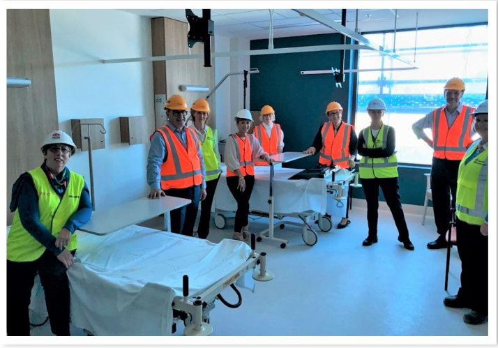
The SNSWLHD Board and CE tour the two bed display room.