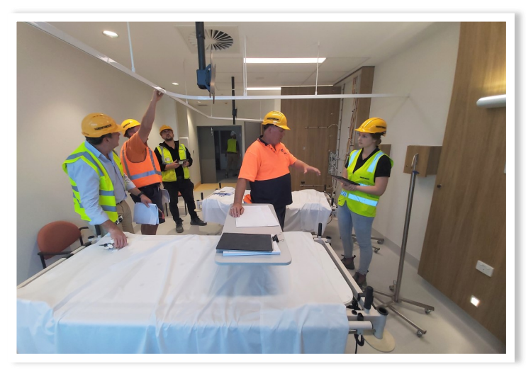
The Asset team inspects the display room with a fine-tooth comb.