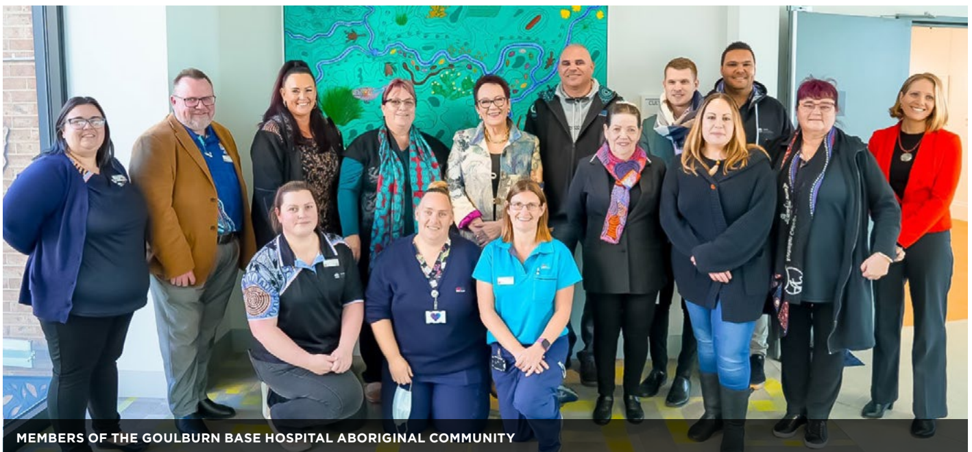
MEMBERS OF THE GOULBURN BASE HOSPITAL ABORIGINAL COMMUNITY