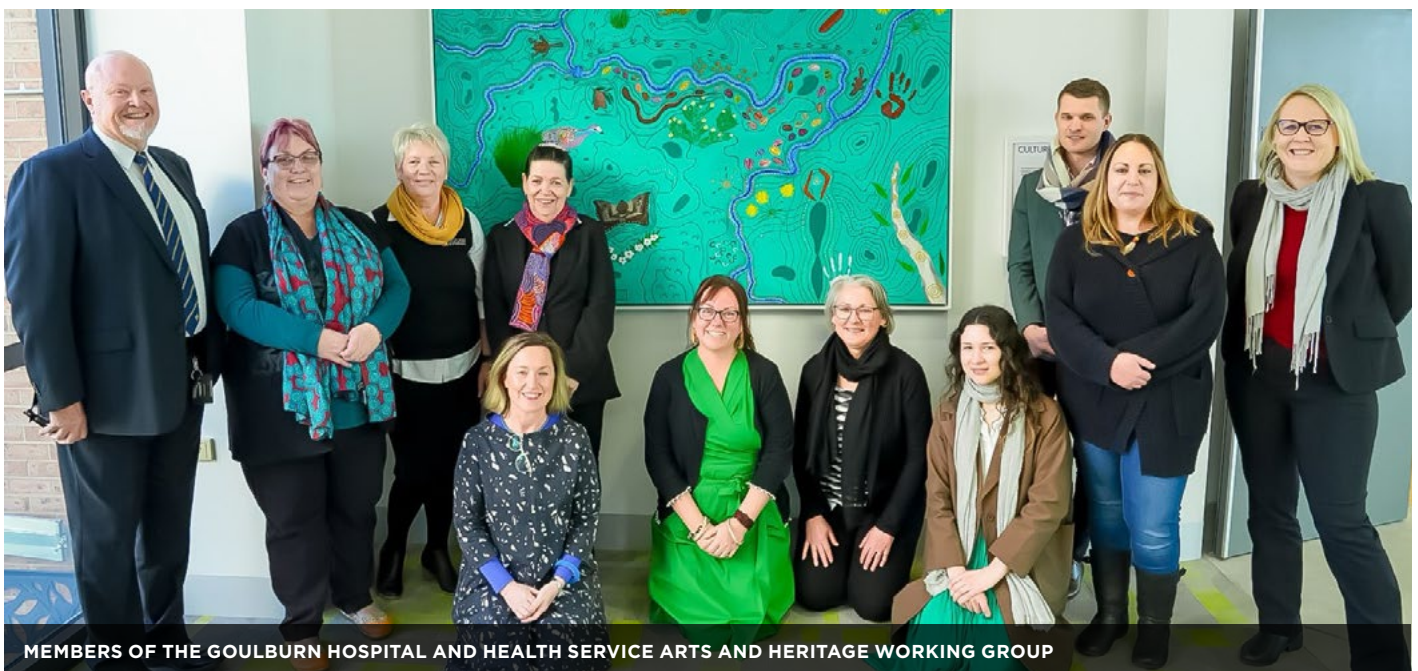
MEMBERS OF THE GOULBURN HOSPITAL AND HEALTH SERVICE ARTS AND HERITAGE WORKING GROUP

Read more about the artwork on the Goulburn Hospital and Health Service website or watch a YouTube video with the artist . Check out some photos from the unveiling below.