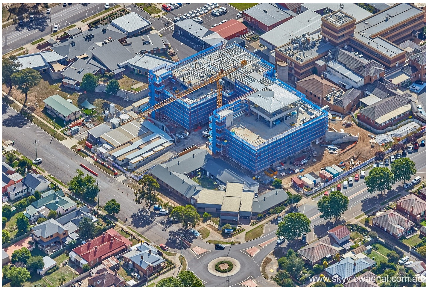
December 2020. Latest aerial view from the corner of Faithfull and Goldsmith streets.

Thank you to all Goulburn Health Service staff, community members and stakeholders who contribute and support the Redevelopment. Your input is gratefully received and the Redevelopment project team looks forward to sharing more information as the project progresses.