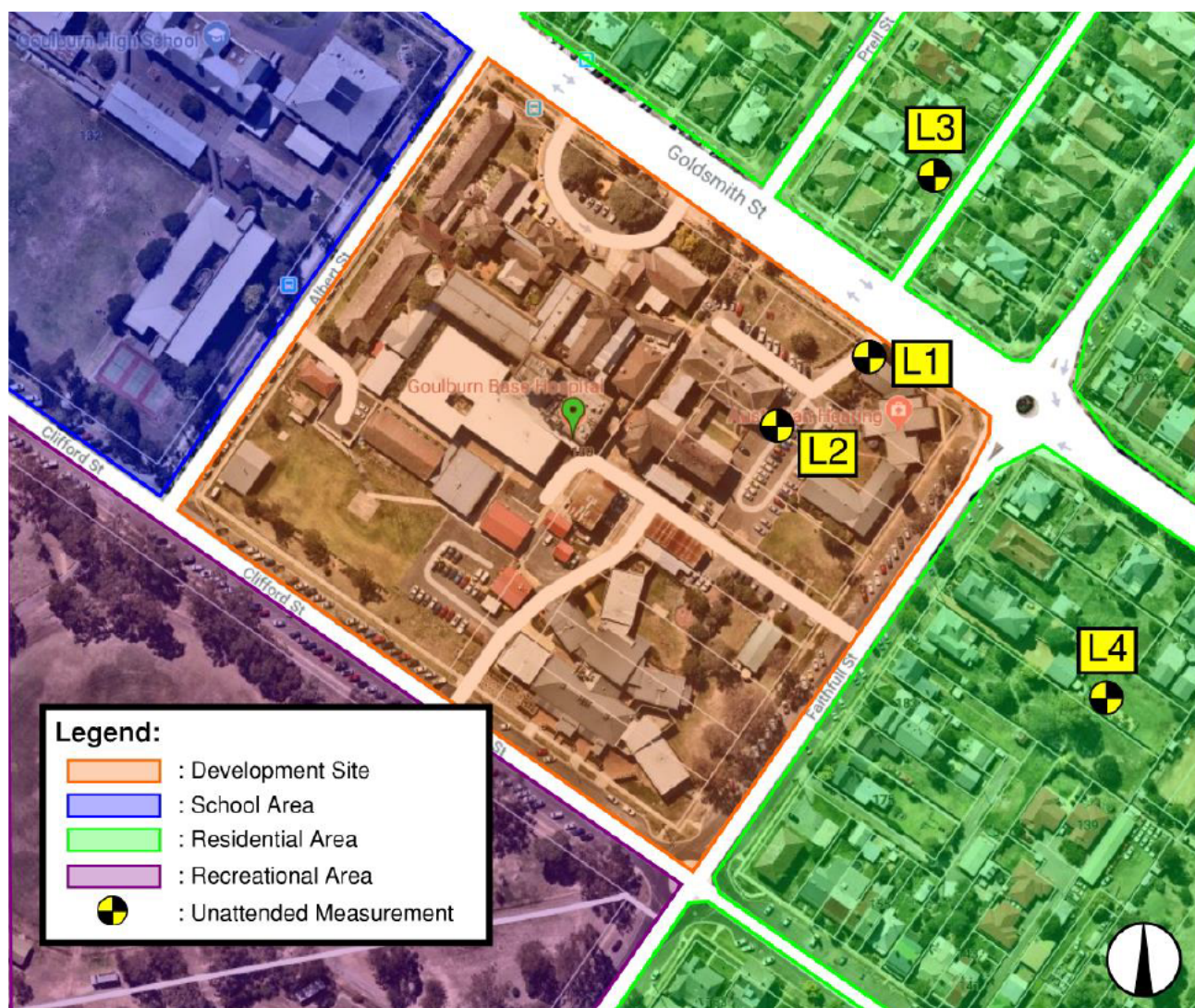
Figure 2: Overview of the Site and Measurements Location

Note: Day is defined as 7:00am to 6:00pm, Monday to Saturday; 8:00am to 6:00pm Sundays & Public Holidays. Evening is defined as 6:00pm to 10:00pm, Monday to Sunday & Public Holidays. Night is defined as 10:00pm to 7:00am, Monday to Saturday; 10:00pm to 8:00am Sundays & Public Holidays.