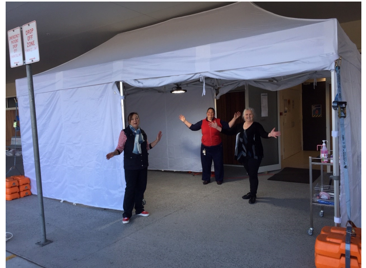
Bega free COVID testing clinic

It is OK to get tested more than once, if you have symptoms at different points in time.