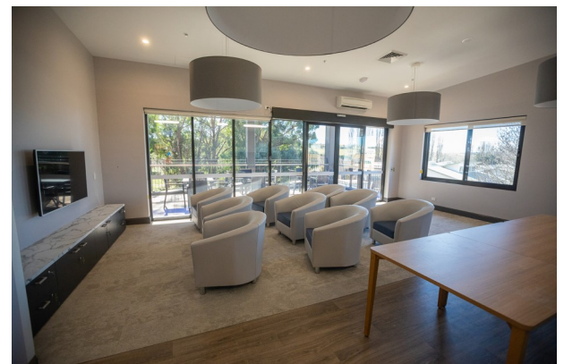
One of the residents' lounges in the Residential Aged Care facility at the new Braidwood MPS.