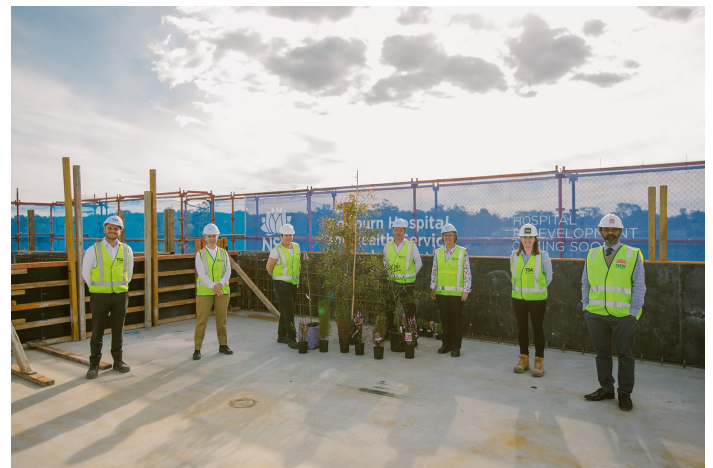
Project team 'Topping Out' at Goulburn Hospital and Health Service Redevelopment (29 September 2020).