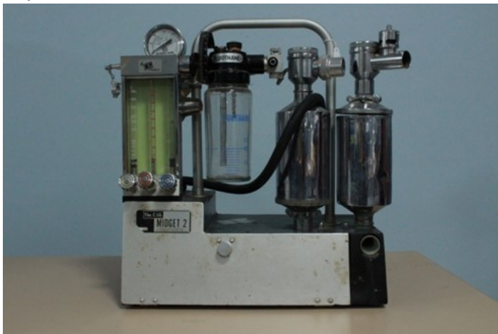
Portable anaesthetic machine, one of 2000 items catalogued items from the Goulburn Hospital & Health Service.

The Heritage survey results will help shape how 2000 catalogued items are displayed in the new four-storey Clinical Services Building, including in the new hospital's heritage exhibition and time capsule.