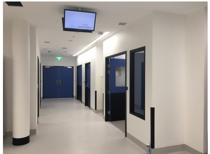
Temporary ED entrance corridor and paediatric treatment space

The District and Health Infrastructure are planning to recommence the second stage of works.