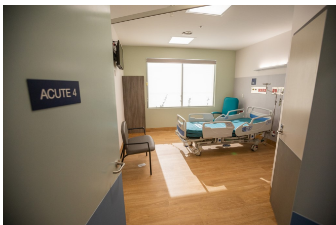
Acute care room.