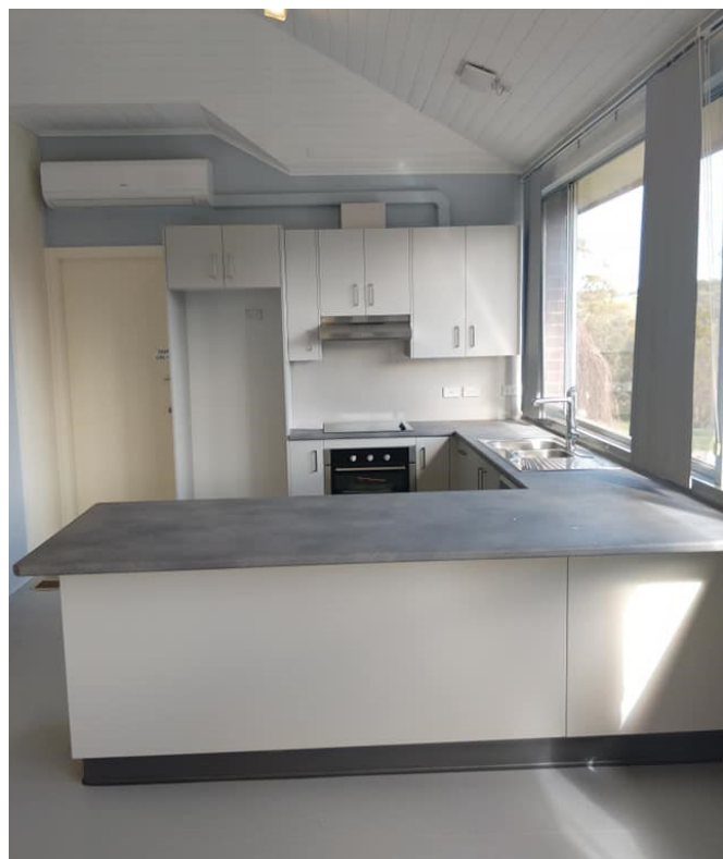
The new kitchen at Crookwell Hospital Wellness Centre.

The ED plans are being finalised to ensure compliance with building and fire standards. The construction tender process will commence soon with an anticipated construction commencement date for these works in early 2021.