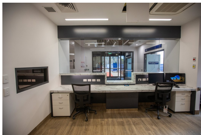
The view from behind reception.