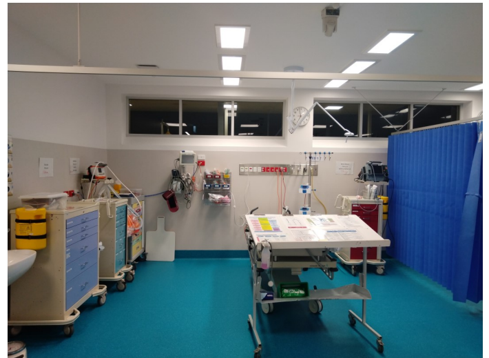
Inside the new ED at Yass Hospital.

Construction works are carefully staged to ensure all hospital services are maintained during the construction period and operations are not impacted.