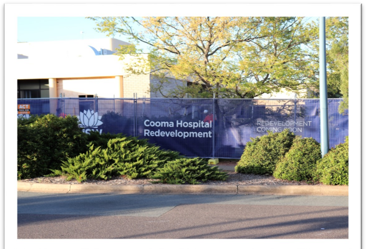
Onsite preparations forge ahead with redevelopment branded hoarding installed.