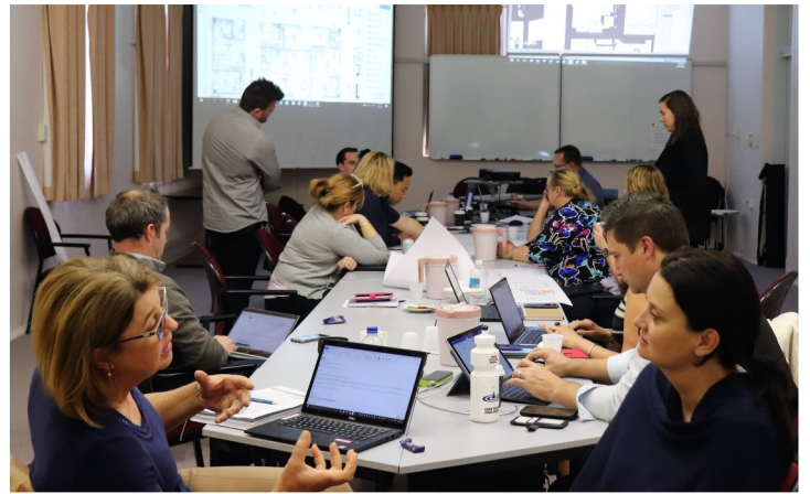
PUG representatives for Maternal, Newborn and Paediatric carefully reviewing the proposed layouts.

The assistance and expertise of the PUGs is invaluable and will help to ensure fit-for-purpose health care for Goulburn and its surrounding communities well into the future.