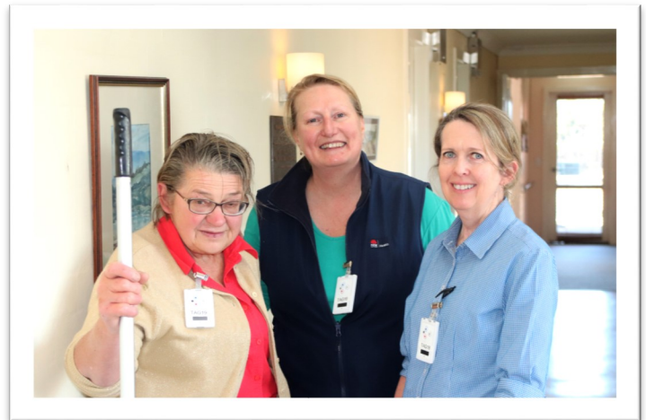
Our fantastic staff make Braidwood MPS more than just a facility.