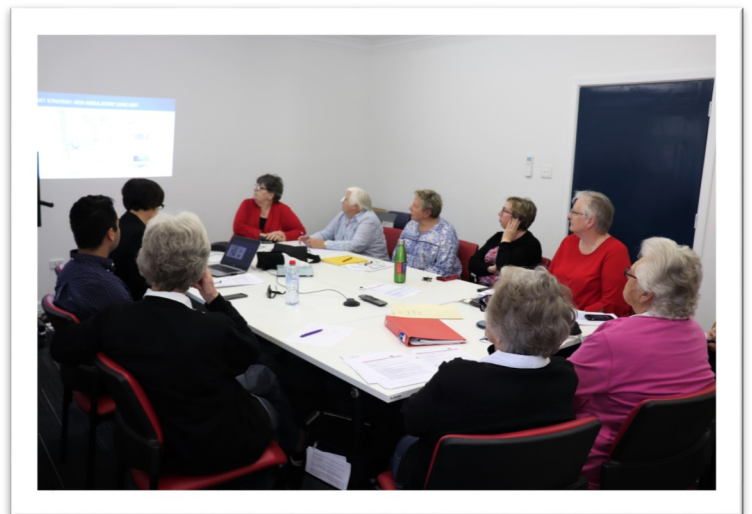
The Cooma Community Consultative Committee (CCC) review the proposed façade.

The proposed façade was also presented to the Cooma Community Consultative Committee (CCC) on Tuesday 16 April 2019, along with the project art strategy, with the Cooma CCC members endorsing the façade.