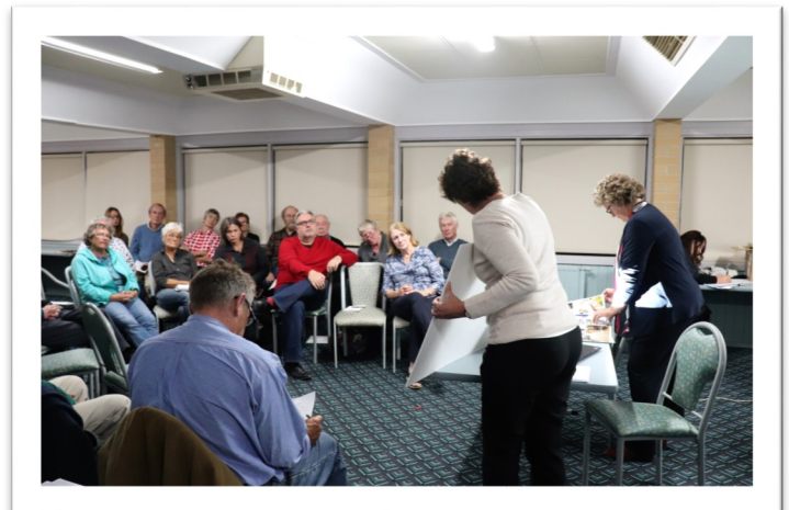
Members of the Braidwood MPS Redevelopment project team present to the Braidwood Community Association.

A staff and community drop-in session will be held on Thursday 9 May 2019, where attendees can learn more about the project's approach to noise, dust and hazardous material during demolition.