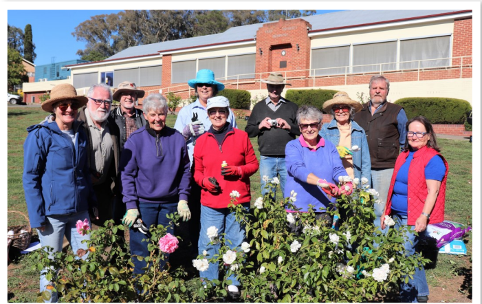
The wonderful group of volunteers from the club, the nursery and the community.

Southern NSW Local Health District, along with the Yass Hospital Redevelopment team, would like to extend a warm thank you to everyone involved.