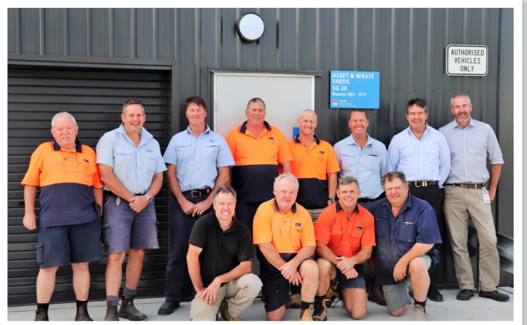
The Asset Management Office team clearly happy with the move.

The main service trench is also nearing completion and installation of the new water tanks and fire pumps has begun.