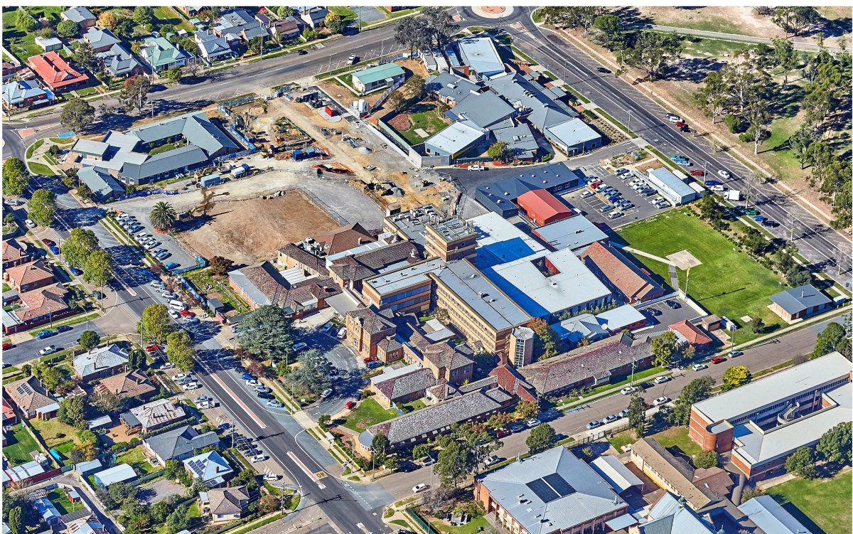
Aerial shot of the Goulburn Base Hospital campus from 27 April 2019.