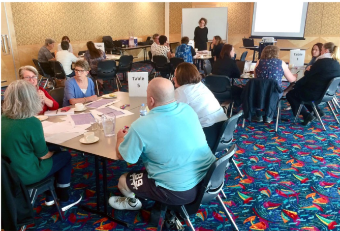
Attendees from the Batemans Bay community workshop session.

If you have any questions or concerns please call 02 6495 8200.