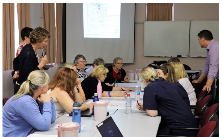
PUG representatives for Perioperative workshop the proposed layouts.