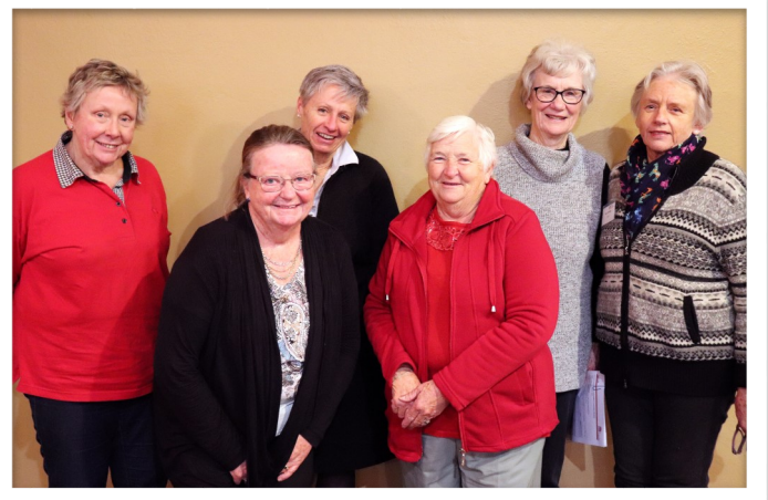
Some of our wonderful Community Consultative Committee members.

Construction documentation has now been completed with works expected to begin early 2019.