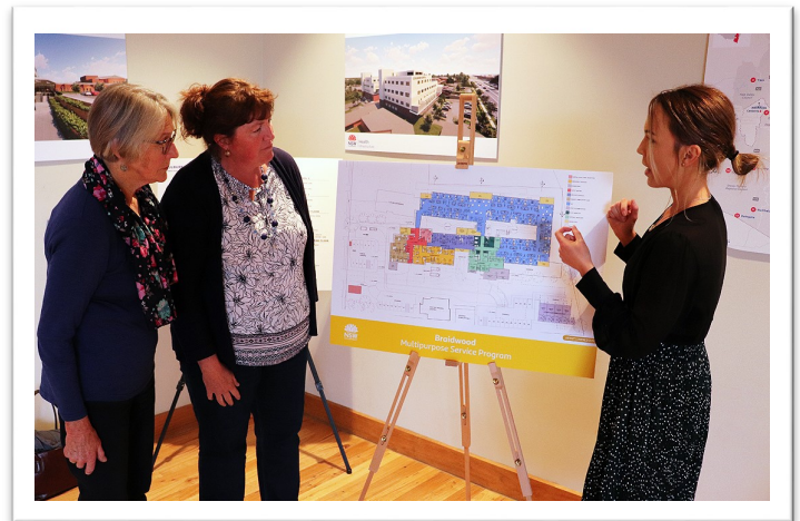
Some of the 2018 Annual Public Meeting attendees learning about the Braidwood MPS Redevelopment.

www.mps.health.nsw.gov.au/Projects/Braidwood