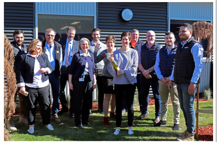
The Goulburn Hospital and Health Service Redevelopment Project Team.

Staff, patients and consumers have been heavily involved in designing the new building to ensure the space reflects the needs of the community now and well into the future.