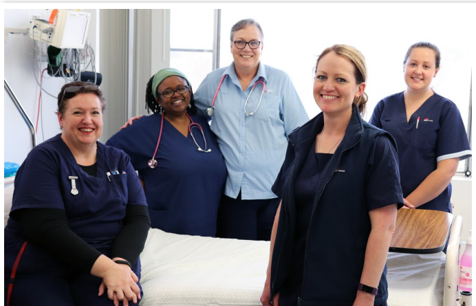
Some of our fabulous staff at Yass Hospital.

The redevelopment will include ongoing 24 hour on-site emergency access and this will be enhanced further with an additional treatment bay and dedicated ambulance entry point. There will also be an increase in inpatient beds from 10 to 12, improved community and allied health treatment facilities, as well as ongoing access to X-ray services.