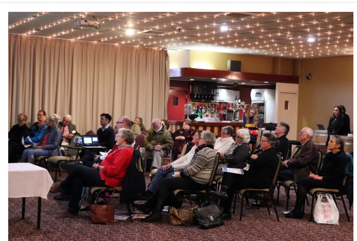
The Cooma Community Consultation attendees.