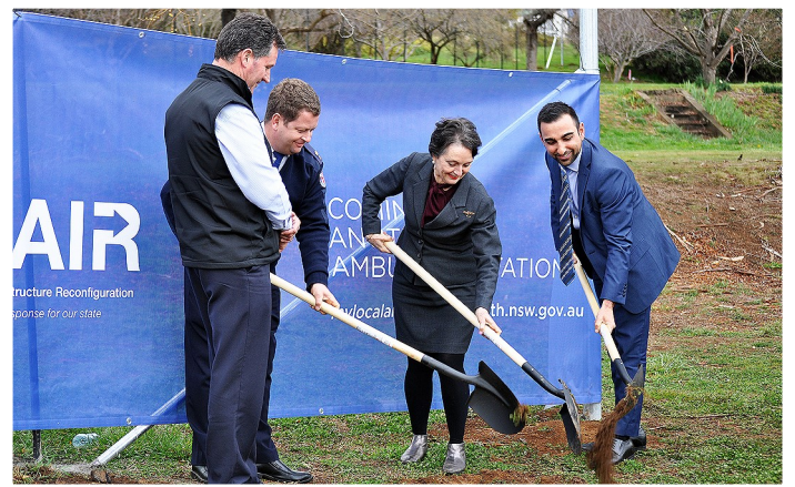
Local MP Pru Goward turning the first sod for the new Yass Ambulance station.

The new Yass Ambulance Station will deliver internal parking for up to four emergency ambulance vehicles, administration and office areas, a multipurpose meeting/training room, relief accommodation, logistics and storage areas, staff parking, delivery and loading bay, as well as an external wash bay.