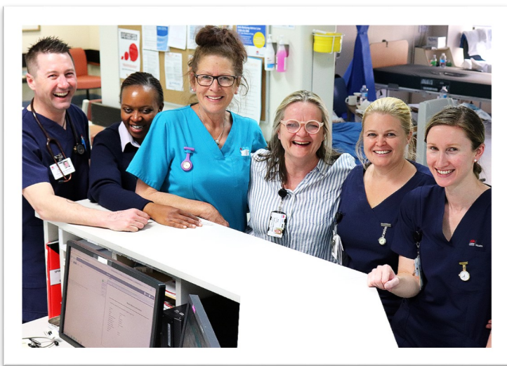
Some of our wonderful staff at Cooma Hospital.

Thank you to all the staff and stakeholders who participated in the PUG sessions, your input has been invaluable.