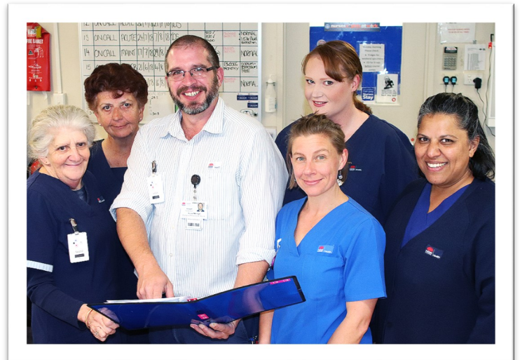
Some of our fantastic staff at Braidwood Multipurpose Service.

www.mps.health.nsw.gov.au/Projects/Braidwood