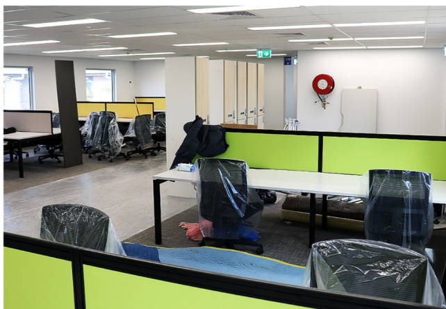
The inside of the Community Mental Health Extension.