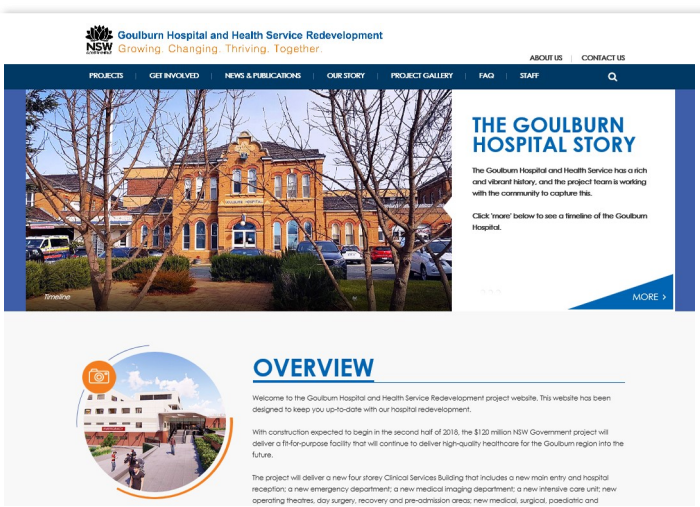
The Goulburn Hospital and Health Service Redevelopment website homepage.

www.goulburnredevelopment.health.nsw.gov.au