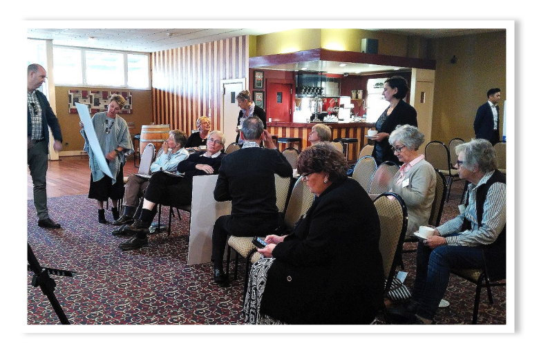
A selection of attendees at the Cooma Community Consultation Session.

Construction is expected to begin towards the end of 2018.